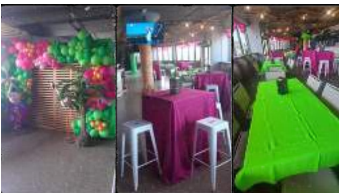
Decor by Cheers Hiring