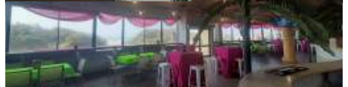
Decor by Cheers Hiring