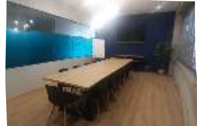
Club Boardroom for hire with aircon; wi-fi & smart tv Seats 12 - 14 pax