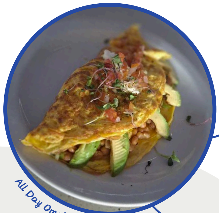
All Day Omelette - Mexican

3 egg omelette with mixed peppers, Avo, beans, salsa, cheese and sour cream