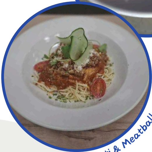
Spaghetti & Meatballs

Sauteed beef with garlic, ginger, seasonal vegetables, noodles & oyster sauce