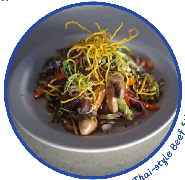
Thai-style Beef Stir-fry

Crushed mustard potato mash, rich onion gravy & grilled pork bangers